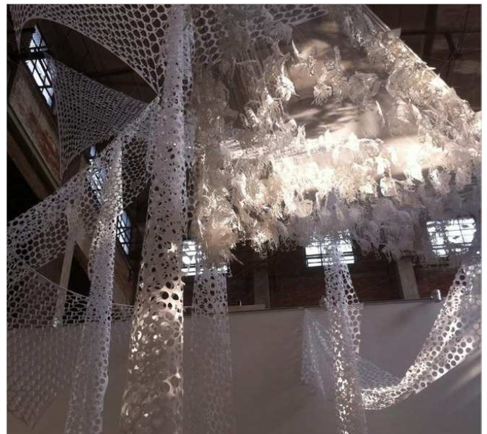
Large-scale paper-cut spatial installations, exhibited internationally 2006–2025