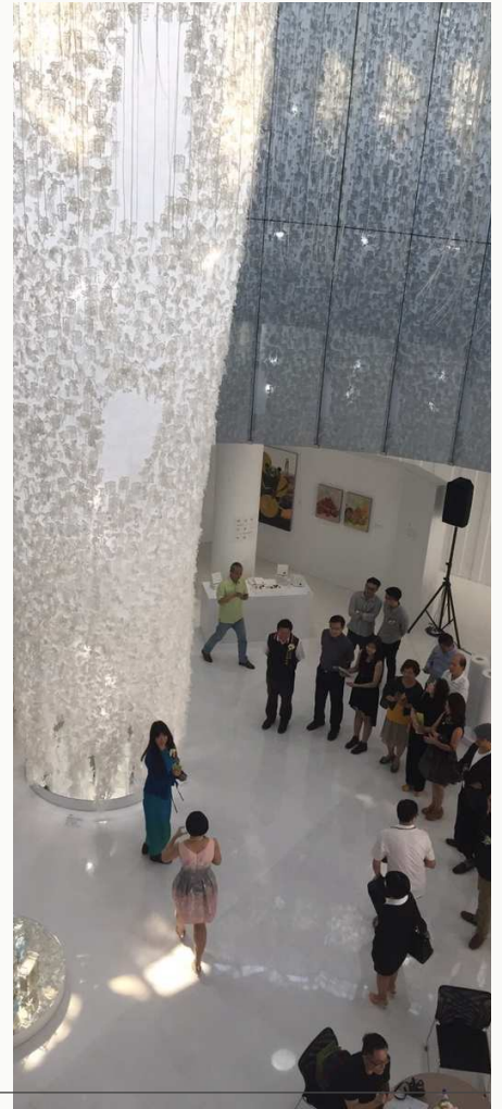
PERFORMANCE & PUBLIC ART