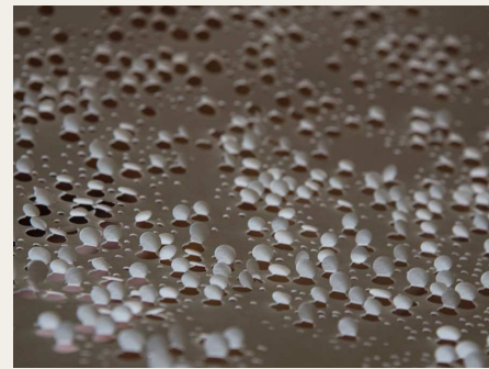
"Each piece is composed of lines that rise and fall like musical notes."