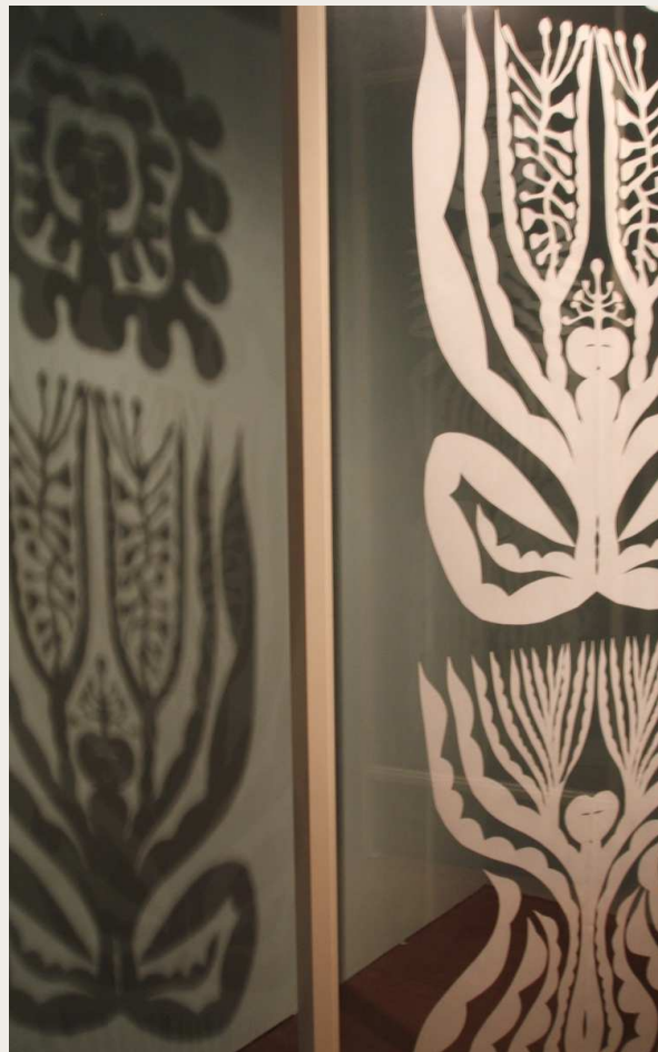
Paper-cut on glass & framed panels